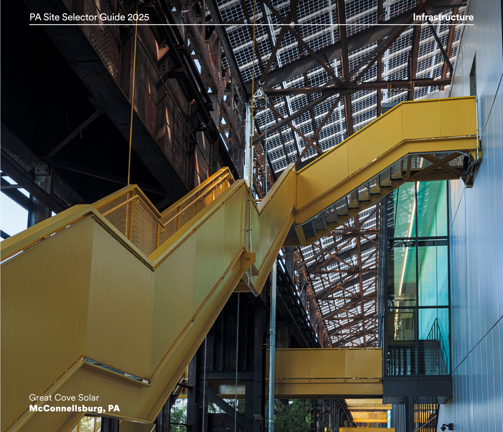
Great Cove Solar McConnellsburg, PA