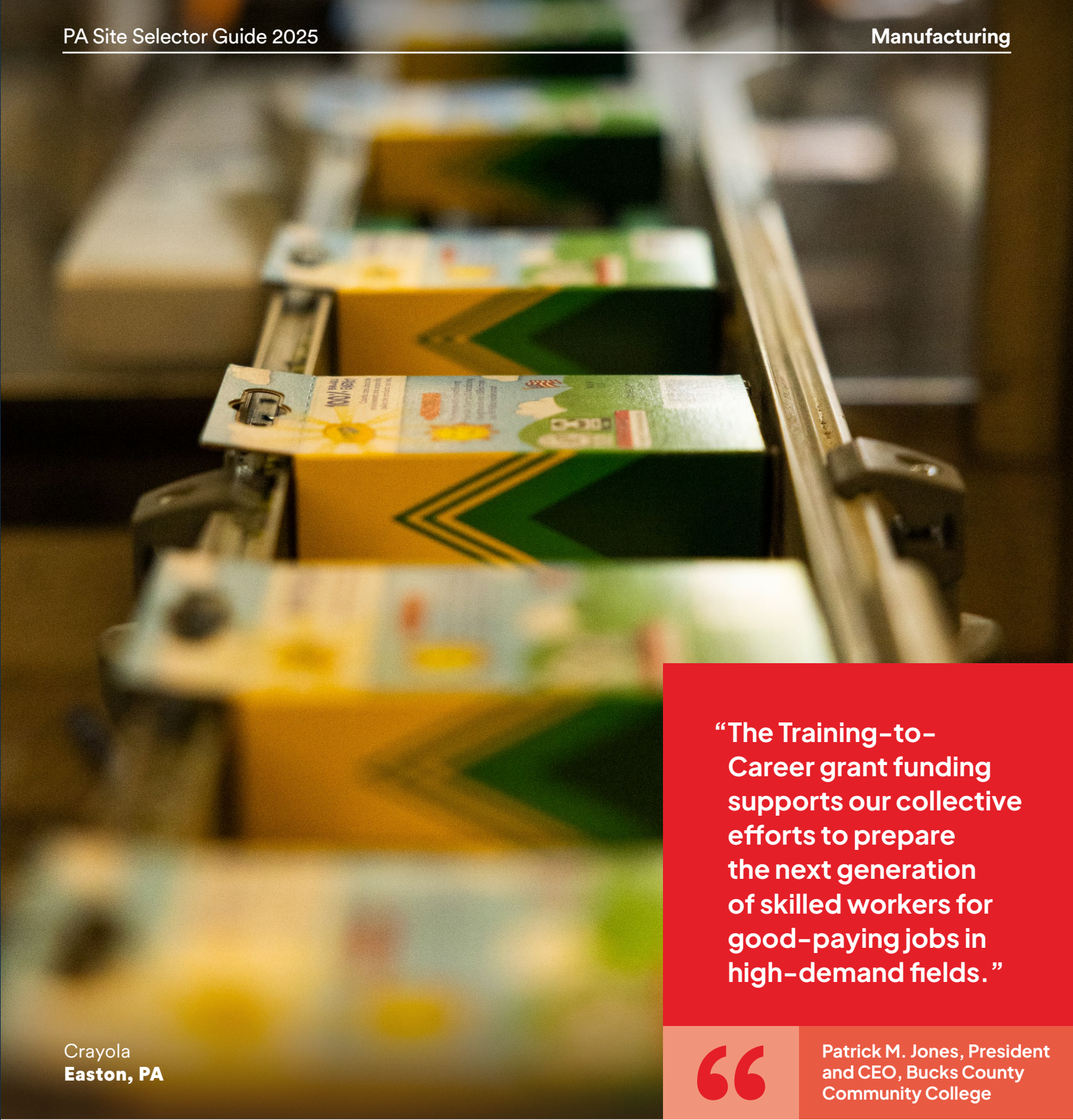
Crayola Easton, PA

Funding university talent to ensure Pennsylvania remains a leader in manufacturing innovation.