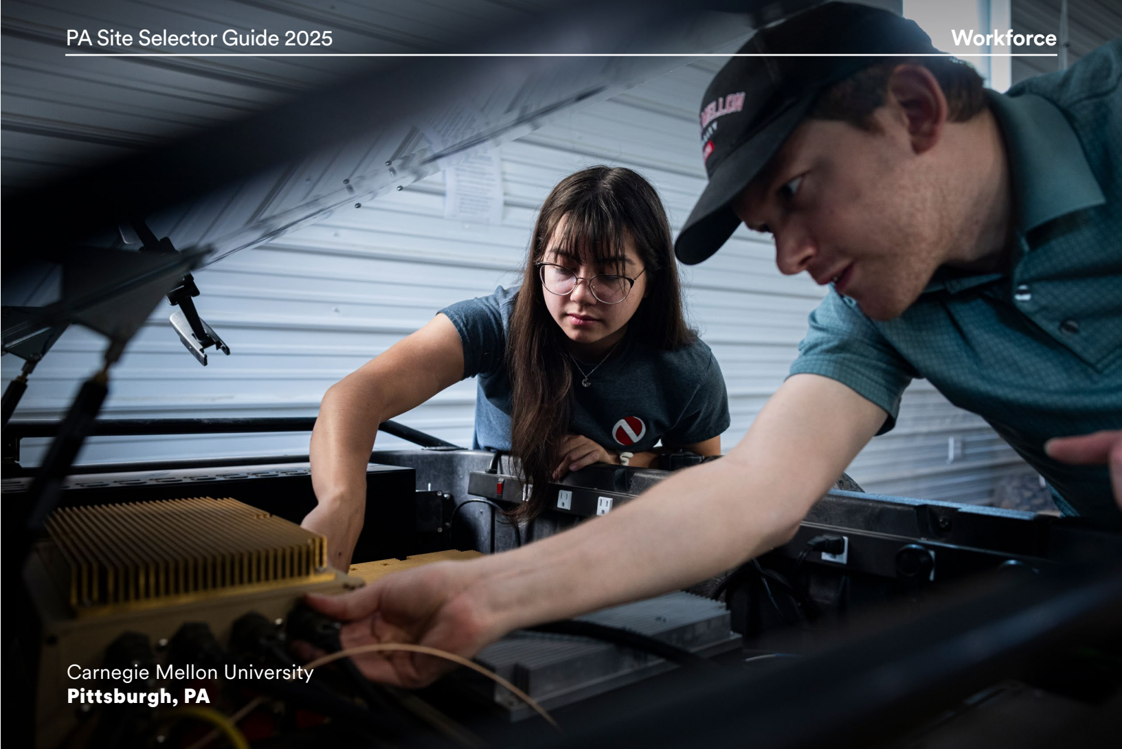
Carnegie Mellon University Pittsburgh, PA